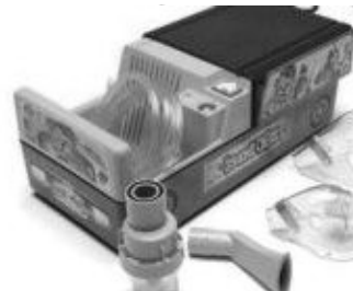
Nebulizers deliver rescue drugs to asthmatics.

be decorated to look like a bus with the included stickers and labels. Most medical insurance companies cover the cost of the machines. For those patients who do not have insurance, or if insurance won't cover it, the nebulizers may be purchased at a very reasonable cash